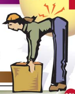
Location of Reported Pain

A recent national survey on Americans' experiences with pain shows that back pain certainly isn't going away; in fact, it remains at the top of the list in terms of where people say they hurt: