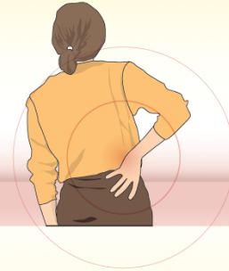
Preference for Particular Pain Rating Scale

A study in the Journal of Rheumatology found that the Verbal Rating Scale (VRS) and the Visual Analog Scale (VAS) are both valid measures of pain intensity, but significantly more patients prefer the VRS to the VAS when asked to rate their pain: